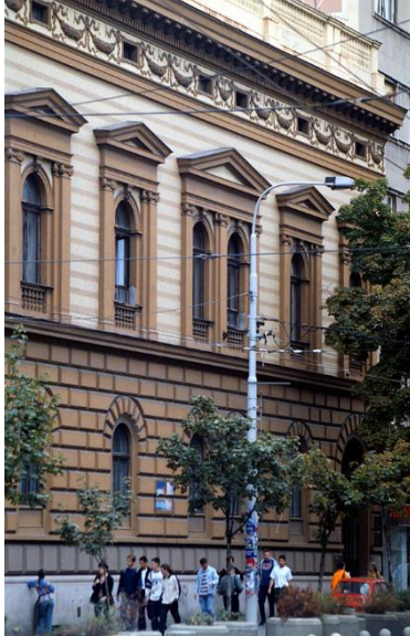
Belgrade Terazije 41 ECPD Headquarters